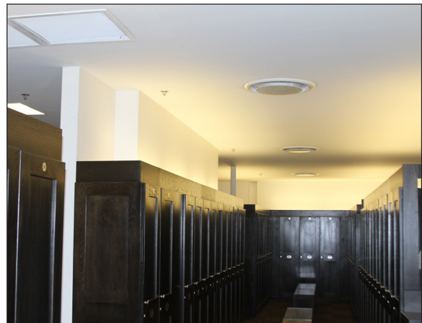
Several R-OMNI diffusers installed in a locker room