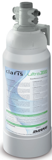
Head sold separately.

Claris Ultra 2000-XXL Filter Cartridge: EV4339-84