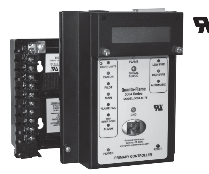
Quanta-Flame 5004-M-78 Flame Safeguard

The 5004-M-78 Flame Safeguard Replacement Chassis consists of the electronics of the 5004-M-85 flame safeguard controller, designed to mount into an existing Q7800A1005, Q7800B1003, or CB 780 (833-2725) wiring sub base. It is a direct replacement for most RM7800E, RM7800L, and CB780 flame safeguard controllers.