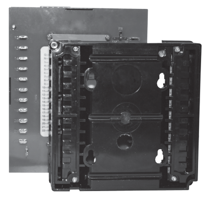
Rear view showing connector pins