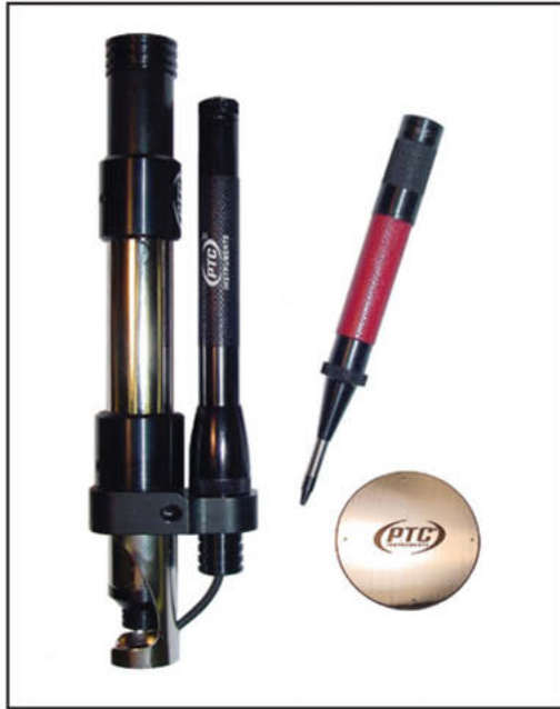
Model 316 shown above