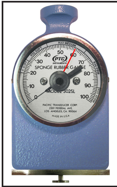
Model 302SL Durometer for foam and sponge rubber

The Model 302SL is a hand-held foam and sponge rubber hardness tester made exclusively by PTC® Instruments. The instrument has the capability to economically test the same type of material checked with an ILD tester. There is no direct conversion from the 302SL scale to ILD readings, however, the 302SL can be used for comparative testing.