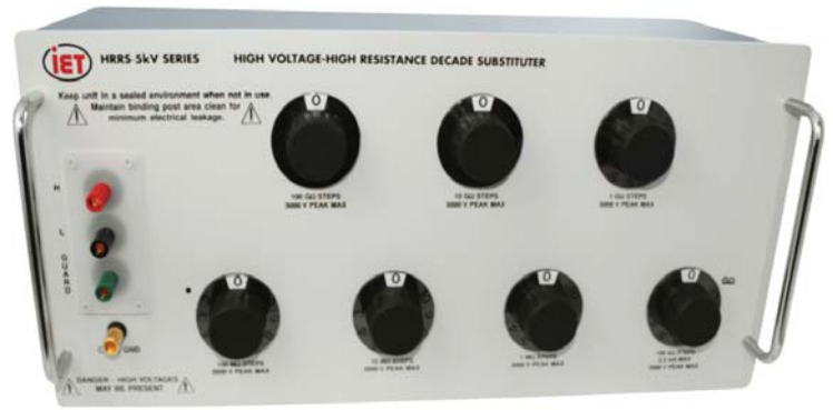
HRRS 7-Decade High-Voltage Substituter