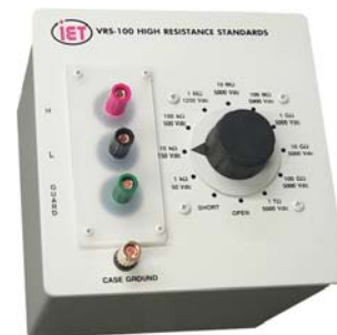
A series of HRRS High-Voltage Substituter Standards customized as a single decade.