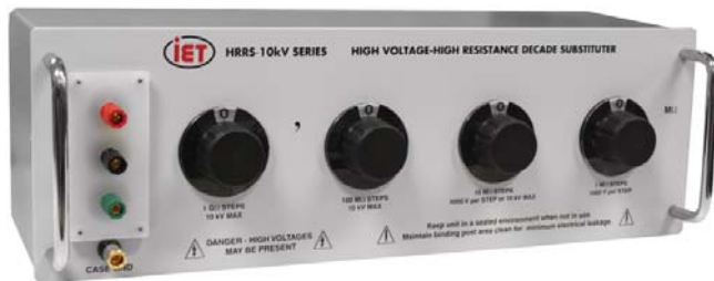
HRRS 4-Decade High-Voltage Substituter

** Tested at low voltages except 10 MΩ at 20 V, 1 GΩ at 100 V, ≥10 GΩ at 1000 V