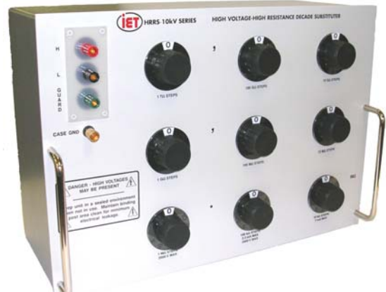
HRRS 9-Decade High-Voltage Substituter